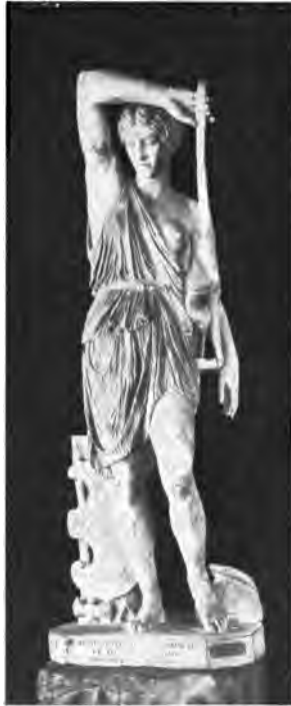
Fig. 69. Amazon.

dle, Hippolyta was so struck by his strength and beauty that she would have given it him, had not Hera, unwilling that he should get off so easily, roused the other Amazons to at-